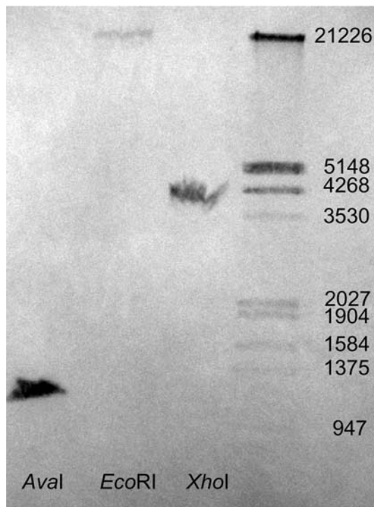
Fig. 3 Southern blot with a GPD probe based on the obtained sequence. C. bombicola gDNA was cut with Ava I, Eco RI and Xho I. The DIG-labelled DNA Molecular-Weight Marker III from Roche was run alongside the gDNA. The size of its fragments are indicated on the right

find out whether a certain length should be respected in order to get sufficient expression. Promoter parts of 488, 394, 352 and 190 bp were tested. All fragments contained the TATA-box found at -78 , and the fragments larger than 352 bp also possessed both CAAT-sequences located at positions -366 and -354 . Consequently, the fragment of 352 bp harboured only one CAAT-sequence, while the 190 fragment had none.